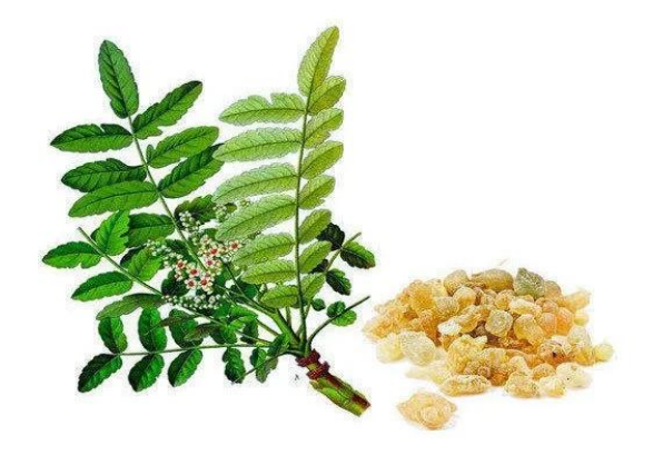
Fig. 1: Boswellia serrata

Plants and plant products have provided humans with food, shelter, clothes, flavourings, scents, and vital components for medicines from the beginning of time. There has been significant use of natural resins in this regard. As coating materials, adhesives, ingredients in cosmetic preparations, scents in everyday rituals and religious rites, and for a variety of medicinal reasons, they have also been put to use. The ancient Hindus, Babylonians, Persians, Romans, Chinese, and Greeks, as well as the ancient Americans, used natural resins primarily for